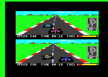
ABOVE: Look at the size of the 'brand!' The full screen delights the eye in 1984.

By 1984, arcade game Pole Position was still doing great in the arcades but at home we were missing a great arcade racer. Until Epyx saved the day. Released first in the States, then in April 1985 in the UK - as published by US Gold.