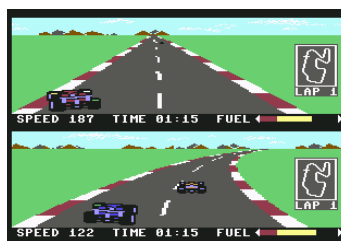
LEFT: Original Pitstop on Atari 800